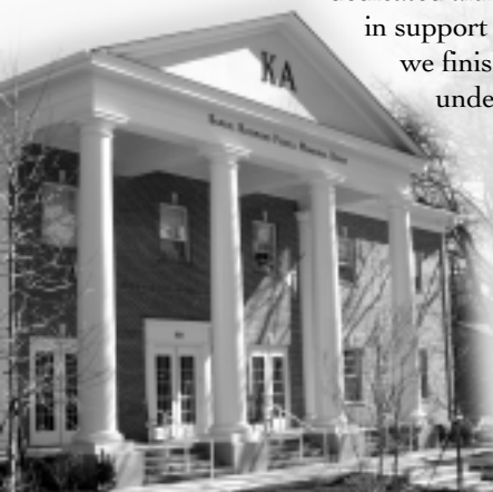
To view pictures from the dedication ceremony, visit our Web site at www.kagatech.com .

The Rebel 'Reck is published for the members and friends of the Alpha Sigma Chapter of Kappa Alpha Order at the Georgia Institute of Technology. Address changes, news items, photographs and contributions may be sent in the enclosed envelope or mailed to Kappa Alpha Order, Alumni Records Office, P.O. Box 161 188, Atlanta, GA 30321-1188, or better yet, send them via our Web site at www.kagatech.com